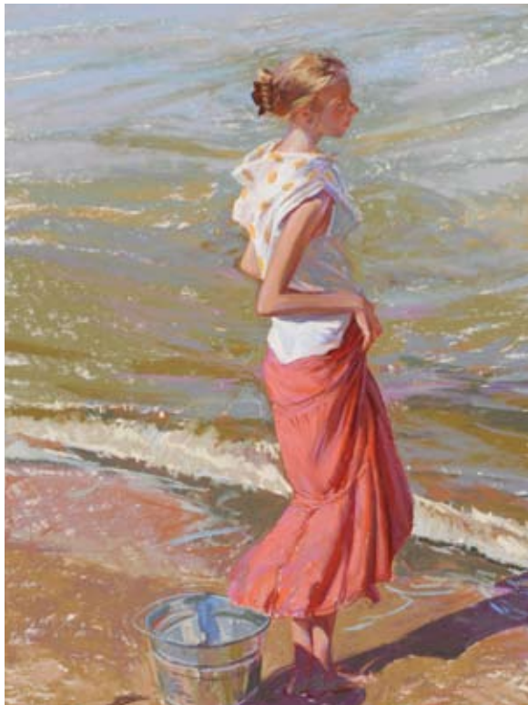
Coming Into Her Own (20x16)