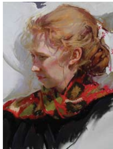
Her Tender Days Go On (14x11)