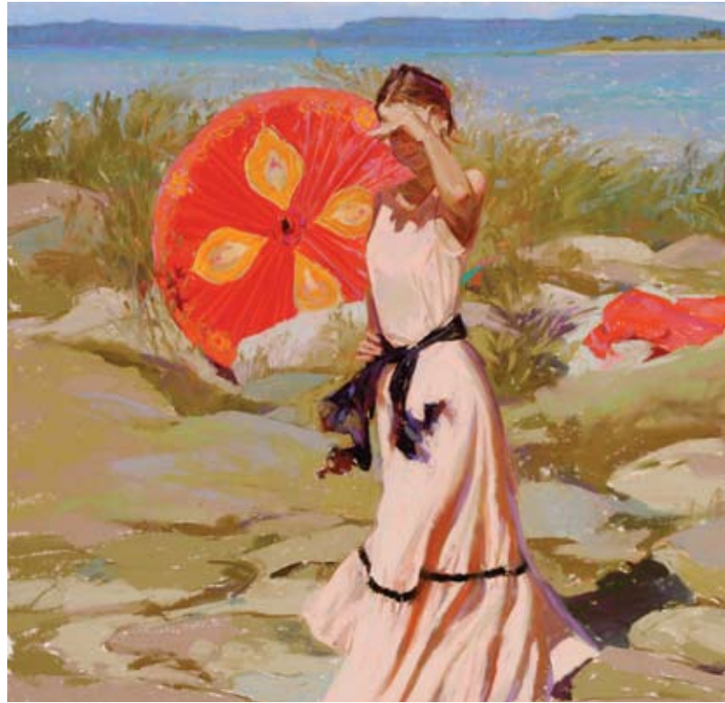
Watching the Sails (16x20)

AH: Do you think it takes a certain personality to do this kind of painting?