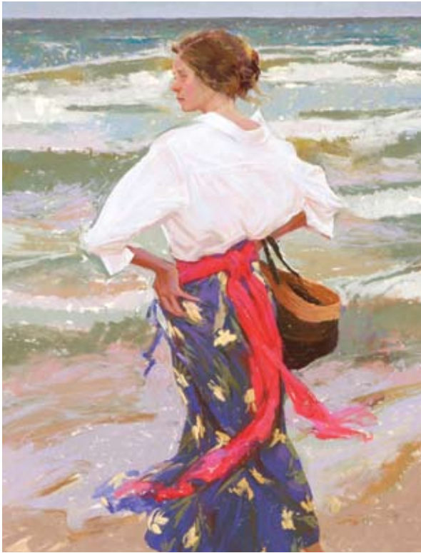
Her Face to the Wind (20x16)